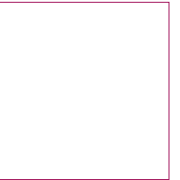
Laughing Cowboys 13 x 19