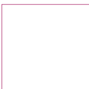
Man Lost in Desert 13 x 19

Roosevelt residents 13 and older, past and present, are invited to sing, read, do comedy, or play an instrument.